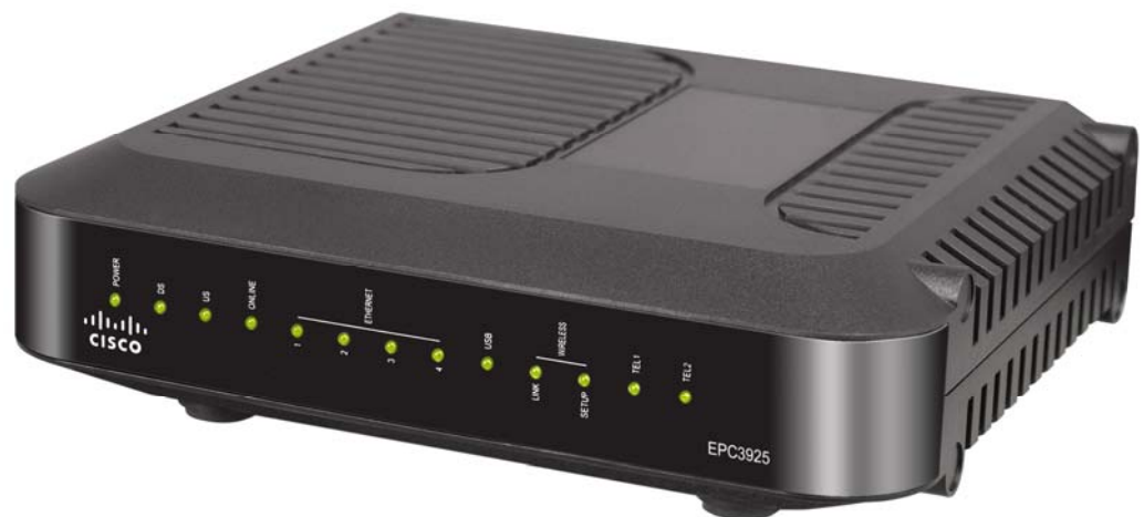
Figure 1. Cisco Model EPC3925 8x4 EuroDOCSIS 3.0 Wireless Residential Gateway with Embedded Digital Voice Adapter (image may vary from actual product and specification)

The EPC3925 integrated router features a Dynamic Host Configuration Protocol (DHCP) server, Network Address and Port Translation (NAT/NAPT) and a Stateful Packet Inspection (SPI) firewall. These features allow the user to share a single high-speed public Internet connection as well as share files and folders between devices in the home network by attaching multiple wired and wireless devices in the active home or office to the wireless residential gateway.