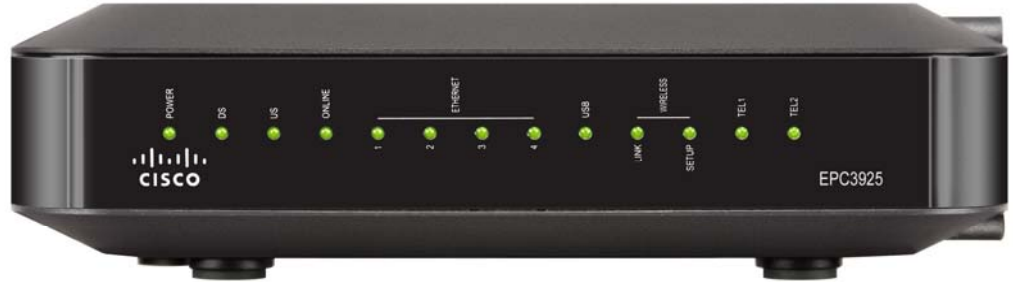
Table 1. Front Panel Features